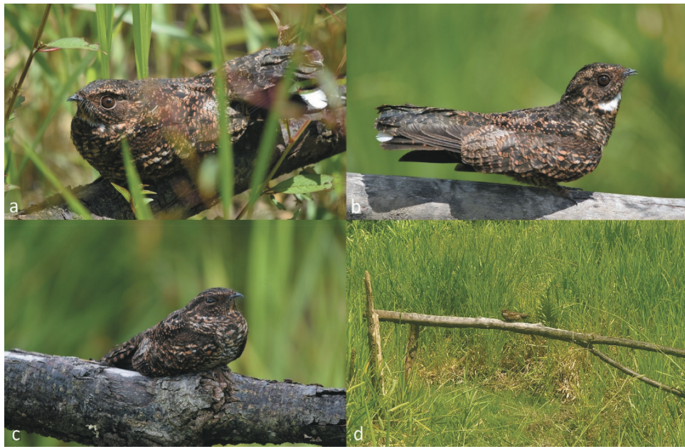
Figure 1. (a) Adult male roosting on a recently cut tree stem, (b) adult male showing head-bobbing behaviour in direct proximity of the nest, (c) adult female present on a tree stem near the nest site and (d) adult male in habitat.