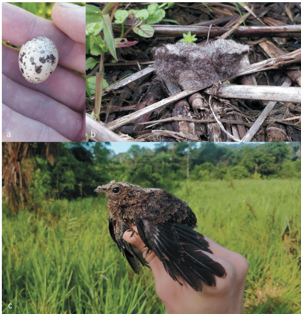
Figure 2. Blackish nightjar. (a) Empty eggshell found in the proximity of the nest site, (b) hatchling about 2 days old and (c) fledgling about 19 days old.