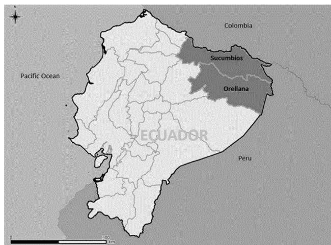
Fig. 1. Study area in the Northern Amazon region of Ecuador, with Sucumbios and Orellana provinces highlighted.