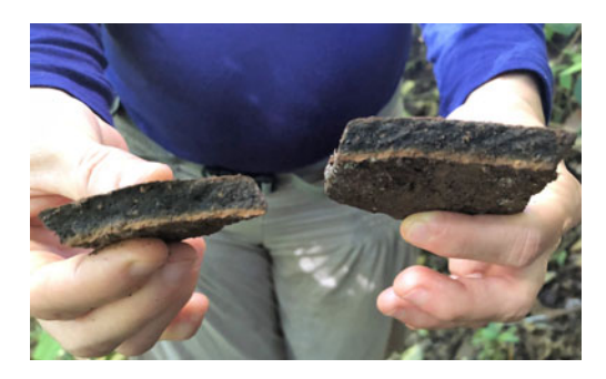
Figure 2. Potsherds found on the surface near the edge of the control site. (Color online)

A forest inventory can reveal the anthropogenic influences on a landscape. In the Amazonian context, a forest inventory involves collecting all species greater than or equal to 10 cm in diameter at 1.3 m up from the ground level (called DBH) and then determining the frequency, density, and dominance of known disturbance indicators (e.g., Anderson and Posey 1989; Balée and Campbell 1990; Peters et al. 1989). The usual size of the forest inventory in Amazonia is 1 ha (ter Steege et al. 2013), although up to 3 ha were sometimes inventoried in the past to show asymptotic species/area curves: the amount of area needed in an alpha-type zone to accommodate the maximum or nearmaximum number of species. It has also been suggested that most diversity can be sampled with highly linear inventories, such as 10 \times 1,000 m or 10 \times 3,000 m (e.g., Campbell et al. 1986).